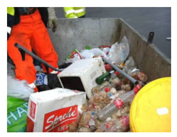
Bulky Items commingled with Refuse

NOTE: Individuals cannot throw away any government owned furniture/property – this must be done through DRMO.