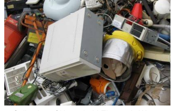
Collection of Household Electronic Waste