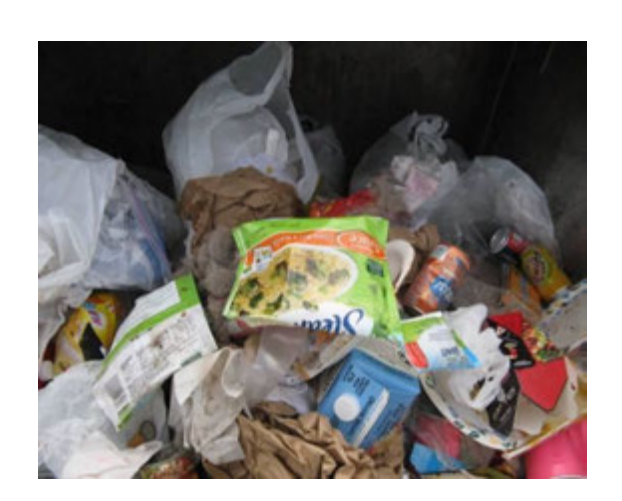
Mixed Plastics in Refuse Container, which was cleaned and is now ready for recycling

Note: Plastics are collected with the regular trash at Panzer Kaserne and Böblingen Housing Area, and incinerated for thermal energy recovery. In this case thermal energy recovery is considered to be recycling.