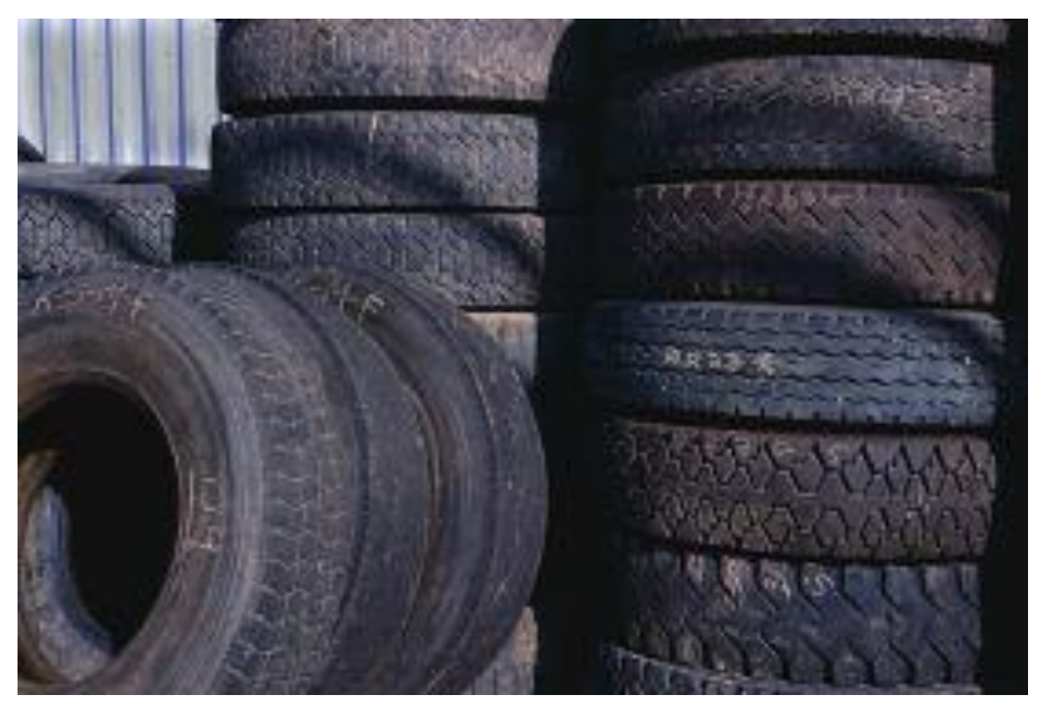
Car Tires without Rims

Rims can be thrown into the scrap metal containers at the DPW yard at Kelley Barracks and near the DOL building at Panzer Kaserne.