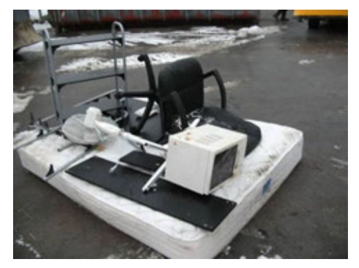
Bulky Items & Electronic Scrap

For large quantities of furniture please call Repair & Services Branch at 421-6288 / CIV 0711-7228 6288 for a pick-up appointment or call your nearest IC.