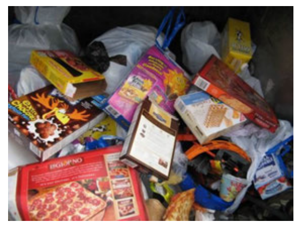
Cardboard (all types) in Refuse which could be also recycled

Large amounts of cardboard should be brought to special cardboard containers (see location of recycling containers at page 18).