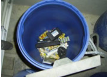
Dry Cell Batteries