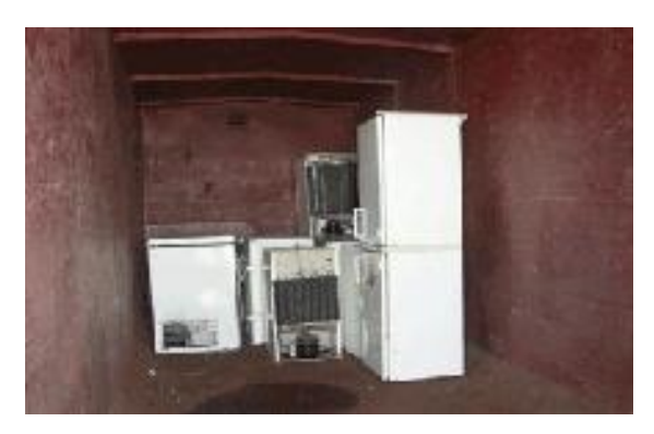
Collection of Refrigerators