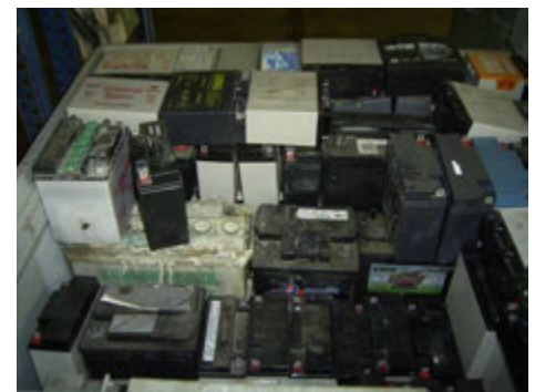
Lead Acid Batteries stored in a Waste Container

Vendors must take your old battery if originally bought there or when you by a new one.