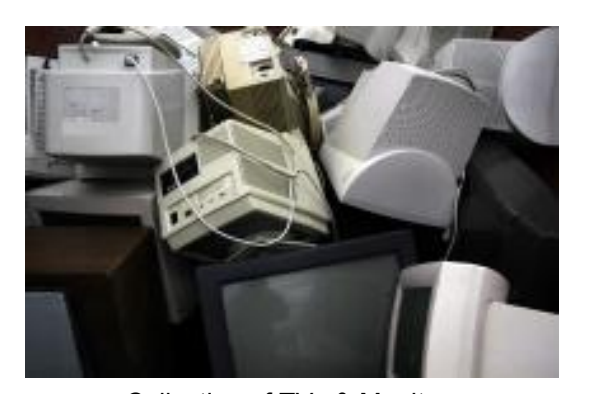
Collection of TVs & Monitors

If you have problems with transportation, look around in your neighborhood if there is someone who can help you, or ask your IC office for help.