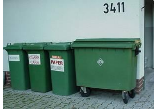
Recycling Islands for multi-family units