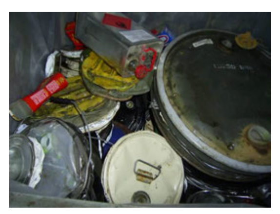
Petroleum, Oil, Lubricant contaminated Metal Containers

Contact the staff for proper disposal and you will receive help.