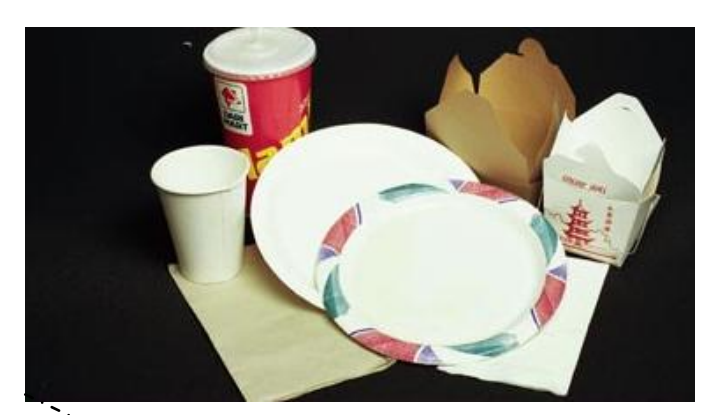
Fast Food Containers