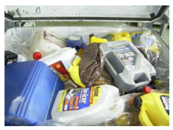
Petroleum, Oil, Lubricant contaminated Plastic Containers